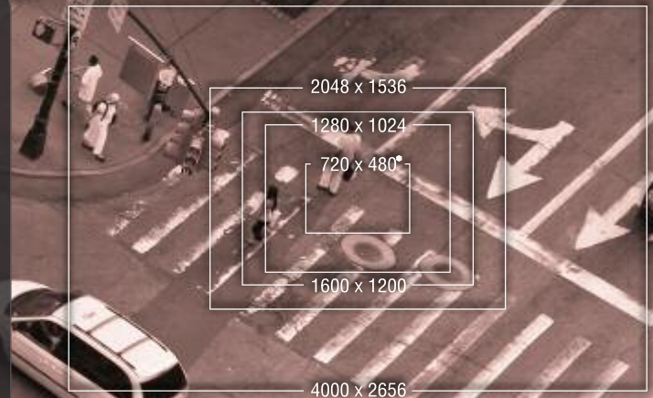
Resolution Comparison – Megapixel to Analog * Resolution of high-end analog cameras

For more information contact: customsales@lumenera.com